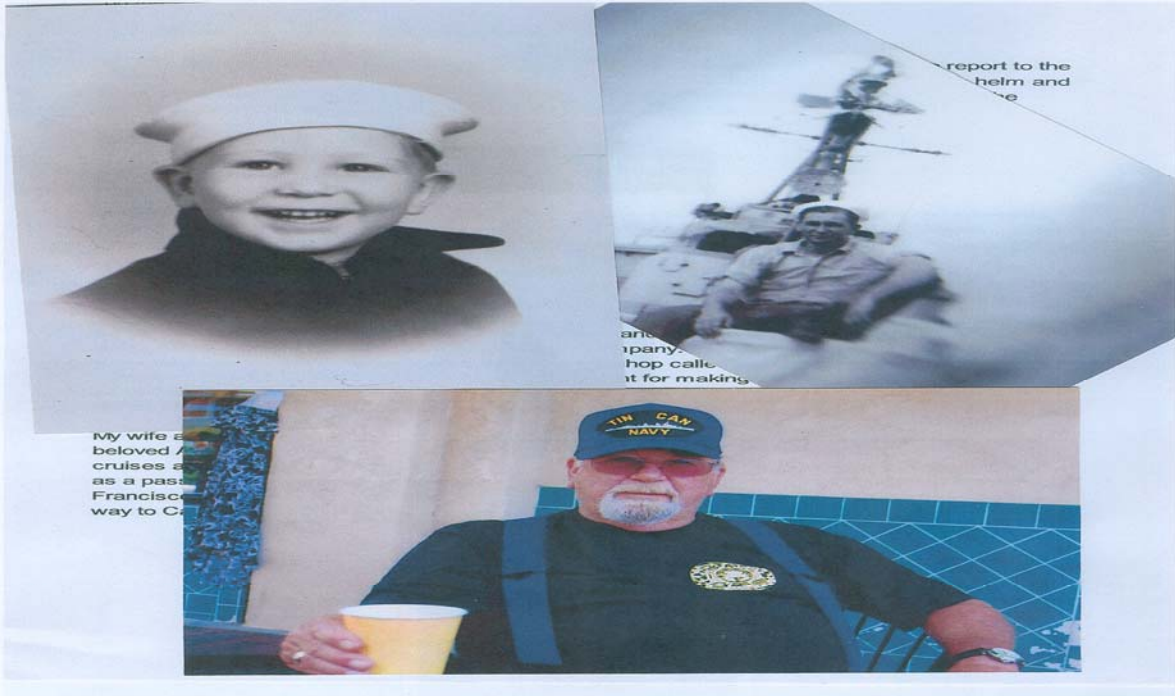
My wife and beloved cruises as a past Francisco way to C